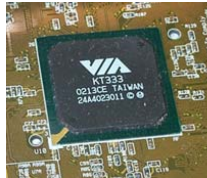
Figure 2 – Neoprene pads MUST NOT be installed