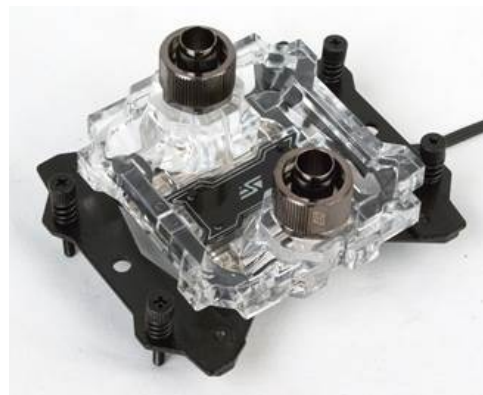
Apogee XL2 in AMD Configuration