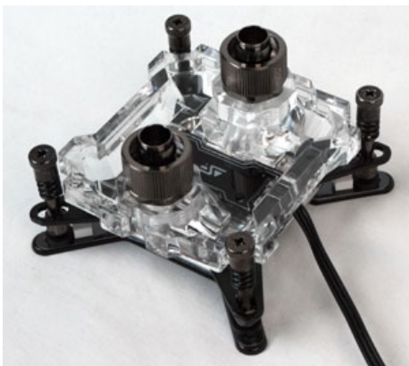
Apogee XL2 in Intel Configuration

The Apogee XL2 includes Swiftech's new IRIS-ECO Multi-Function ALED light controller and PWM signal splitter hub, which is being released concurrently. The waterblock is compatible with all the current Intel® and AMD® desktop processors, and ships with installation hardware for both.